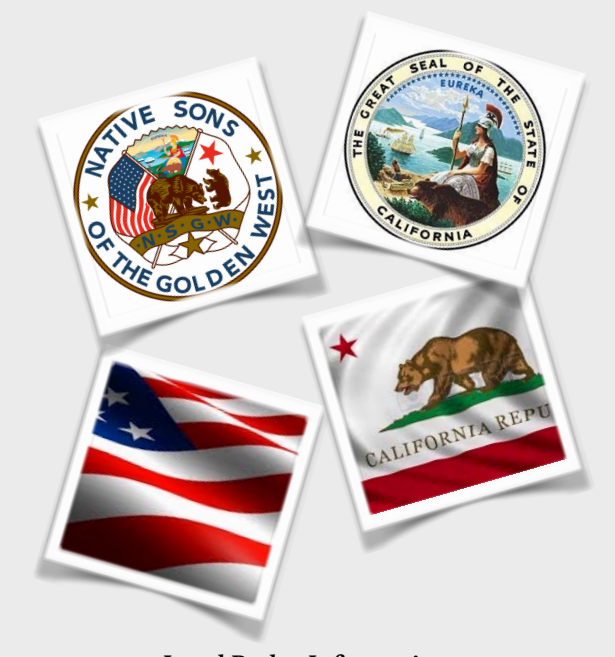
Local Parlor Information